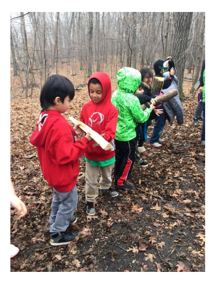
Annual Report 2015-16