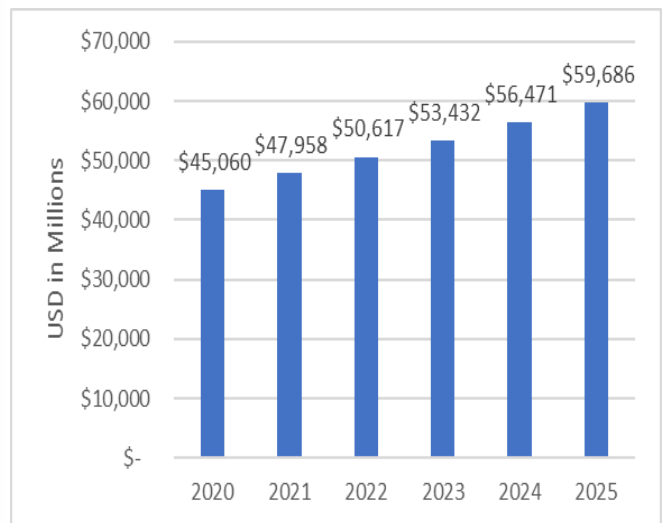
Global Consumption of Merchant Switching Power Supplies Market Segments