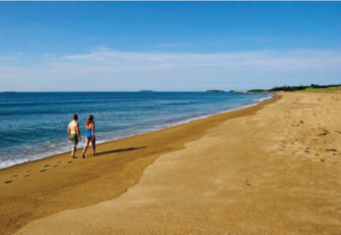
Nearby beaches to explore

If not by water, wildlife is easily accessible from our historic downtown through an enormous series of walkable, hikeable, and bikeable trails maintained by the Kennebec Estuary Land Trust (KELT) and the City of Bath. These pathways connect the south end of the city to the north, weaving from downtown, through historic residential areas, schools, and recreational facilities. There are trails winding through many undeveloped parcels, which are treasured by locals and tourists alike. Among them are Thorne Head, Sewall Woods, Butler Head, Basin Preserve, and Lilly Pond Community Forest, which offer wildlife in their natural habitat and waterfront vistas.