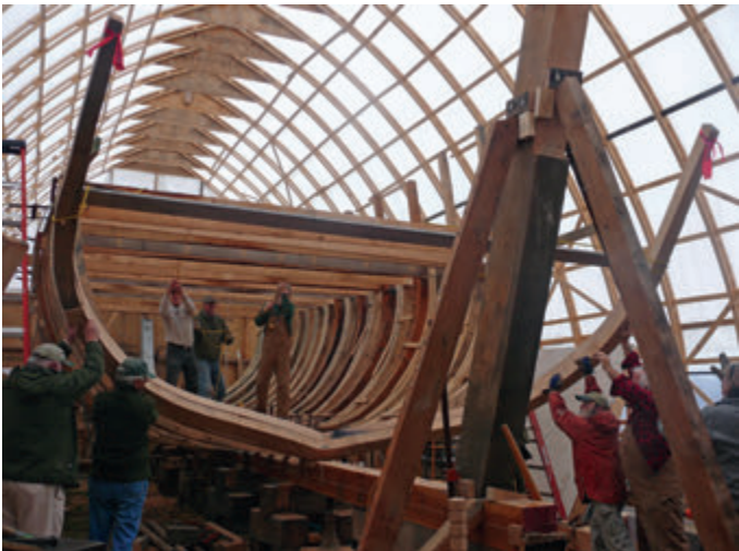
Maine's First Ship – The Virginia - Launched in 2022

for its preservation efforts. The Trufant Historic District is bounded on the east by Washington Street, on the west by Middle Street, and on the north and south by Pine and Corliss Streets respectively. Both districts contain preserved and