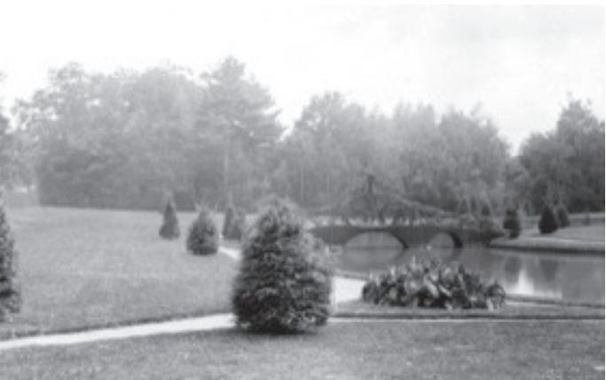
Oak Grove Cemetery

restored examples of Greek Revival, Victorian, and Aesthetic period housing. Many were built by wealthy families that settled in Bath during the days of wooden shipbuilding. Beautiful churches