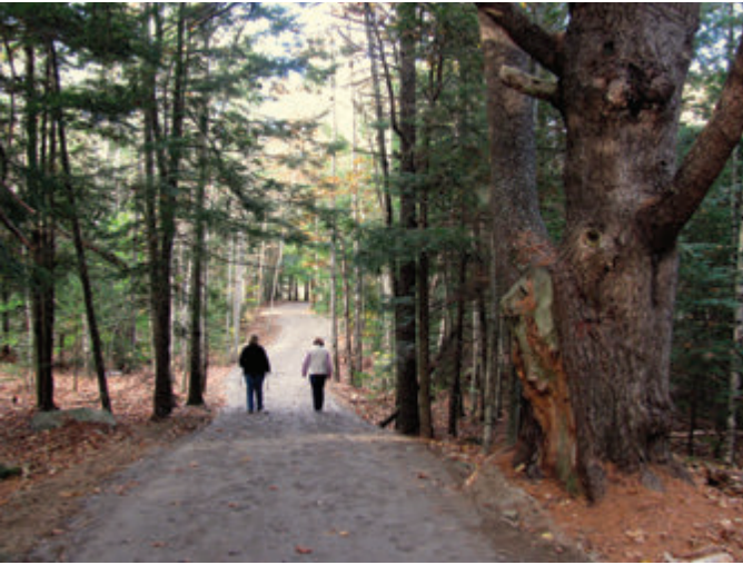
Miles of trails to enjoy

No matter the season, Bath has something to offer the outdoor enthusiast. Migratory birds abound on the shores and rivers of this area. Bath is on the Atlantic Flyway, and Merrymeeting Bay has over 50 species of freshwater fish and ten species of anadromous fish such as the rare Atlantic salmon, shortnose Sturgeon, and Atlantic sturgeon. Bald eagles and osprey nests are easily spotted. If you visit in the warmer months, several outfits offer highly enjoyable Kennebec River tours. Visiting the midcoast in 2021 and 2022, the Steller's sea eagle attracted birders from across the globe to this area.