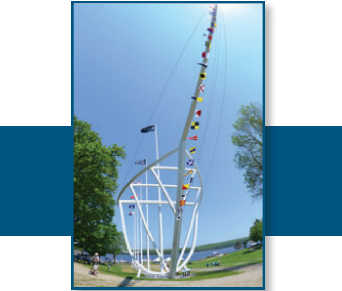
Maine Maritime Museum