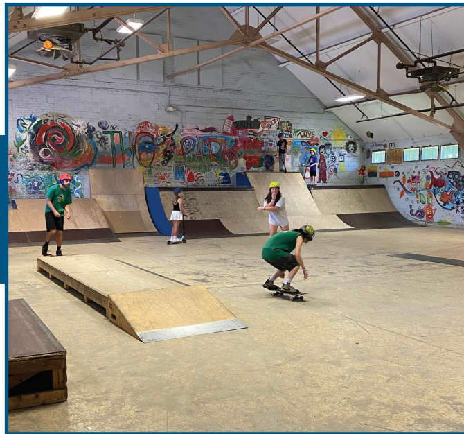
Midcoast Youth Center & Skatepark