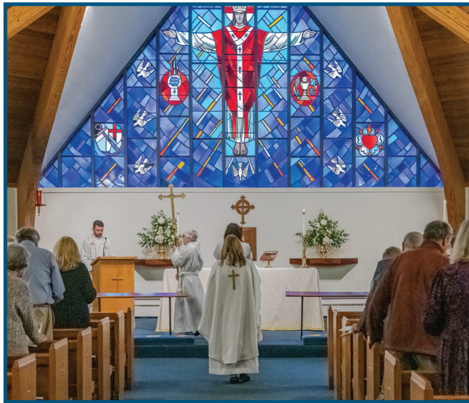
Grace Episcopal Church