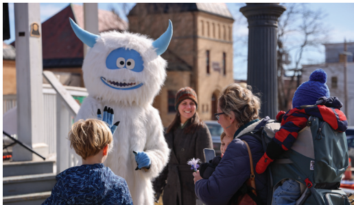
Winterfest - Third Saturday in February

For more details, weather cancellations, and updates, please check visitbath.com or follow @MainStreetBath on social media