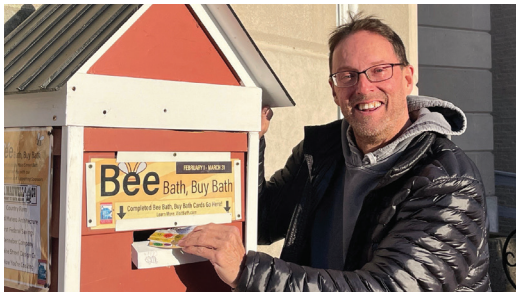
Bee Bath, Buy Bath - February & March