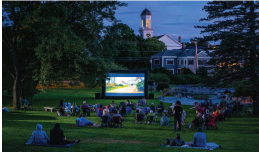
Movies in the Park - First and Third Monday in August