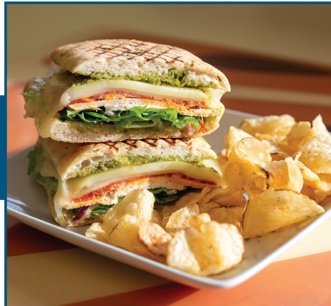
Sisters Gourmet Deli