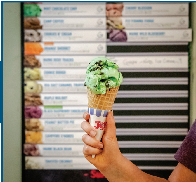
The Fountain Ice Cream & Deli