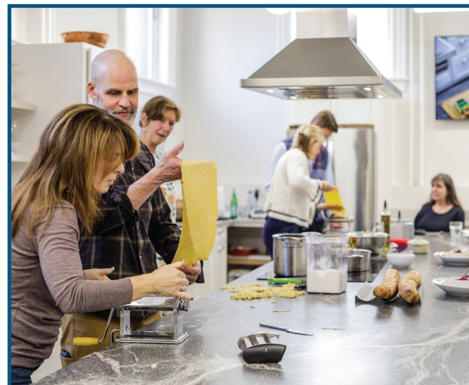
Now You're Cooking