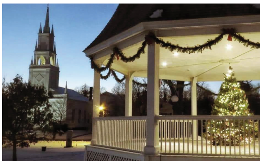
Old Fashioned Christmas in Bath - A month of events from late November through December