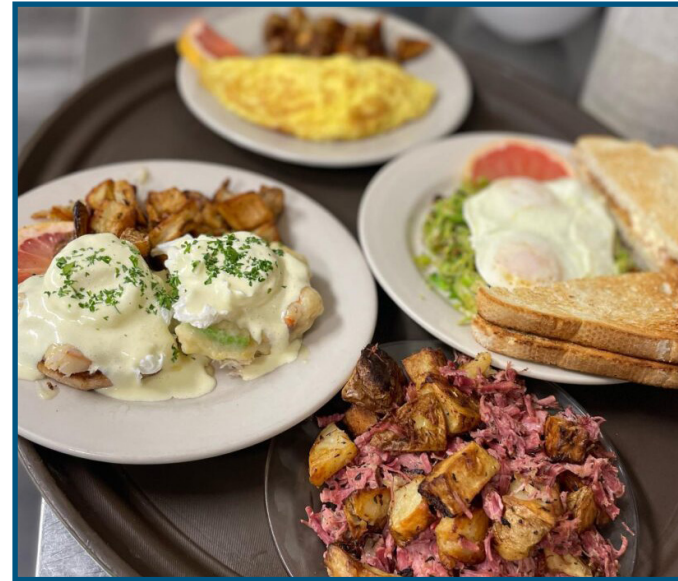
Mae's Café & Bakery