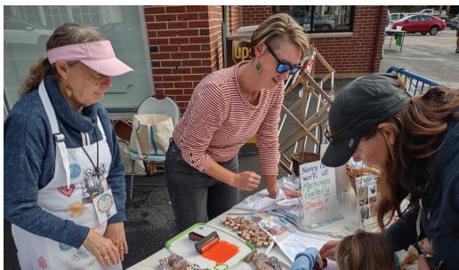
Autumnfest - First Saturday in October