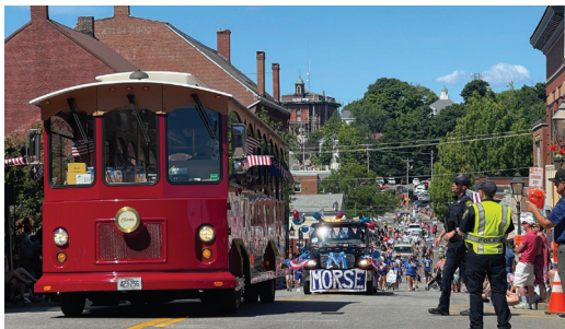
Bath Heritage Days - Multi-Day Festival surrounding Independence Day