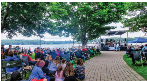
Summer Concert Series - Tuesdays, Fridays, and Saturdays at Library Park and Waterfront Park from late June to early September