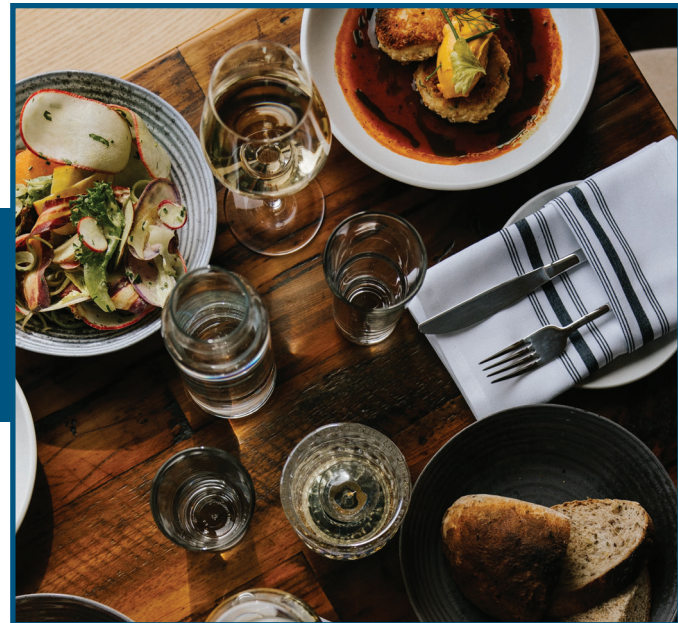
Linden & Front