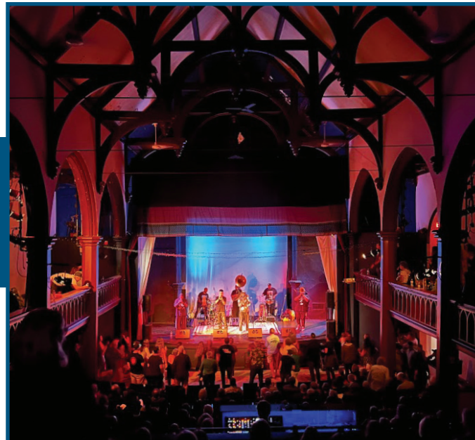
Chocolate Church Arts Center