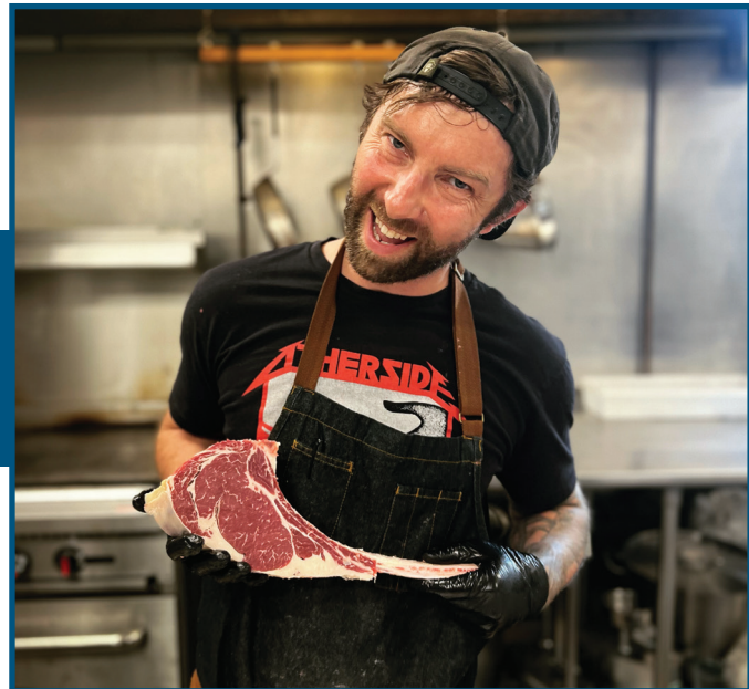
Kennebec Meat Company