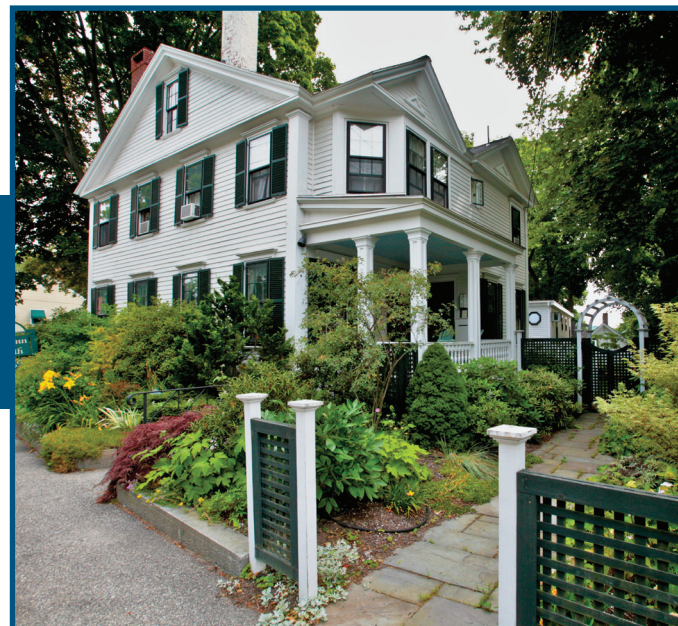
Inn at Bath