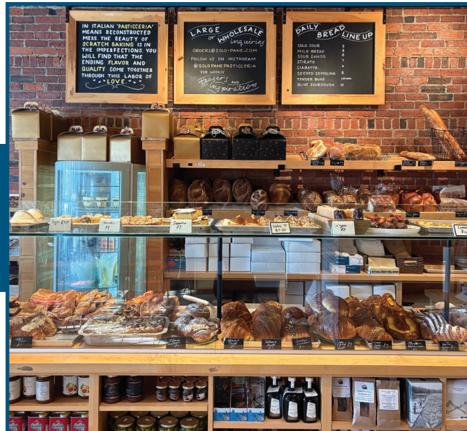
Solo Pane e Pasticceria