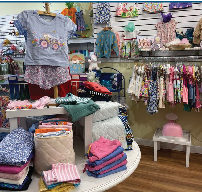
Pitter Patter, Inc

• Indicates a location on the Regional Map - on reverse • Indicates a location on the Downtown Map - above H Indicates the location of Historical Marker(s)