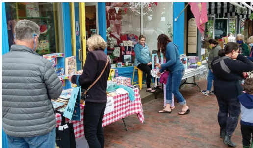
Spring Into Summer - Third Saturday in May