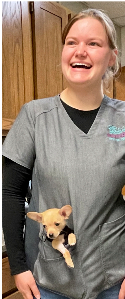
Veterinarian at Westport Animal Clinic with Vanilla in their pocket

The dog was cared for at the emergency clinic and was treated for severe hypothermia. On Monday Vanilla was transferred to Westport Animal Clinic for more observation. Vanilla was observed for another day at the animal clinic where all the staff fell in love with the small pup. The dog then received all its shots, heartworm testing and neutering. Vanilla found a loving home with two young boys to give him lots of love and attention. It was