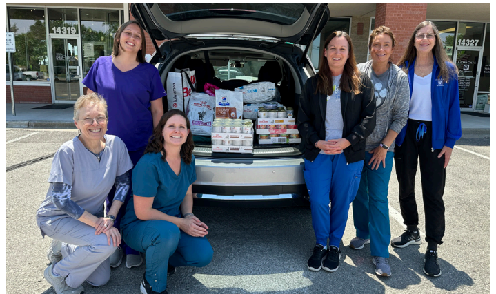
LionsGate Pet Hospital staff with a car load of pet supplies for distribution.

P et food pantries, community outreach, shelters and rescues are always delighted and thrilled to receive food, beds, blankets, medicine, towels, pet gates, carriers, kennels, bowls, collars, leashes, anything pet related. We receive donations from LionsGate Pet Hospital in Overland Park, KS and happily deliver.