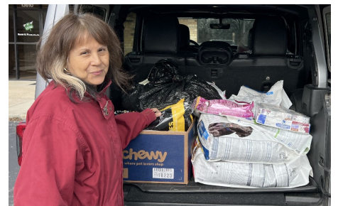
Angels Heart Resue was delighted to receive donations from LionsGate.

We thank and appreciate LionsGate Pet Hospital and their clients for all their support! LionsGate Pet Hospital also makes monetary donations in memory of their client's pets that have passed on. We are honored and humbled by their support.