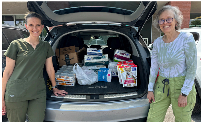
LionsGate Pet Hospital staff with a car load of pet supplies for distribution.

The staff and their clients at LionsGate Pet Hospital are giving angels. LionsGate donates to BARK in memory of their clients that have passed.