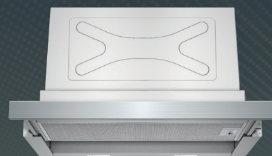
60cm slide-out rangehood