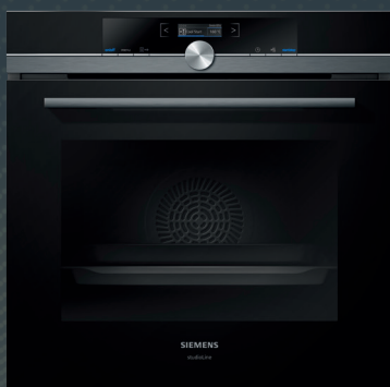
iQ700 studioLine pyrolytic oven