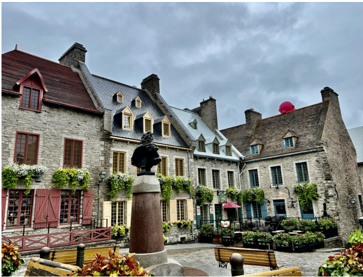
Place Royale in Old Quebec City

Thanks for joining me for this glimpse into the muddy middle of a writer's journey from reader to author.