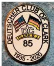
DC 85 TH ANNIVERSARY PINS • $5

See any Vorstand member if you are interested in purchasing.