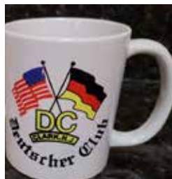
DC COFFEE MUGS • $5

See any Vorstand member if you are interested in purchasing.