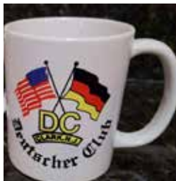
DC COFFEE MUGS • $5

See any Vorstand member if you are interested in purchasing.