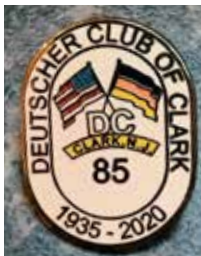
DC 85 TH ANNIVERSARY PINS • $5