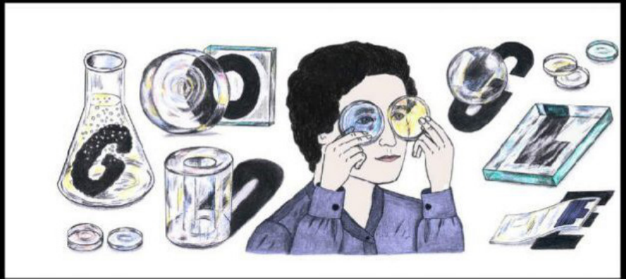
Google Doodle Honoring Marga Faulstich

Email: info@thegermanschool.org Website: www.thegermanschool.org