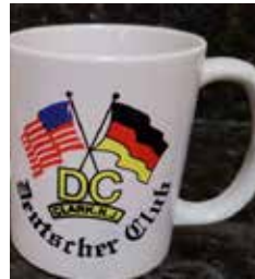
DC COFFEE MUGS • $5

See any Vorstand member if you are interested in purchasing.