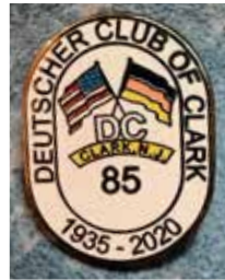
DC 85 TH ANNIVERSARY PINS • $5