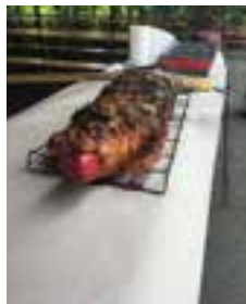
The Guest of Honor