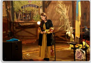
All proceeds will be used to support Ukrainians in need