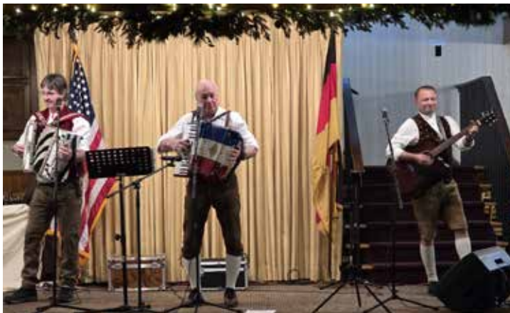
The FELLBERG BUAM bring the mood of the Alpine Mountains to the Deutscher Club of Clark