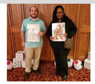
Case Systems arrives