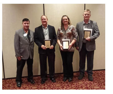
Thank you to our outgoing board members!