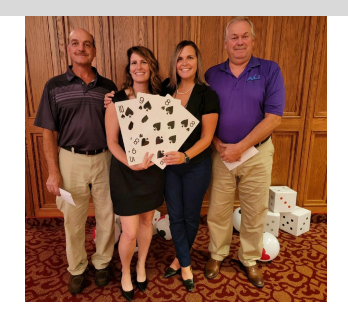
AVU Registrations arrives