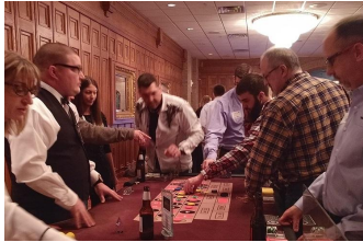
GLBMA Members and Guest enjoying the annual Casino Night