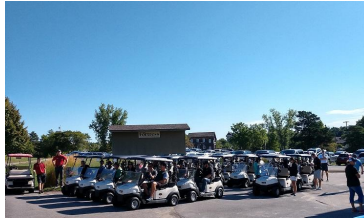
Golfers ready to hit the links at the Fortress Golf Course.