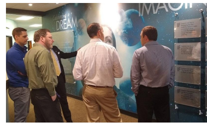
Members listen to the Duperon Values and If Statements prior to the plant tour.