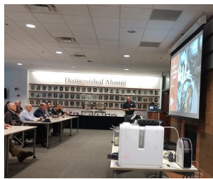
Industry 4.0 Presentation by The Center and ITL Tour.