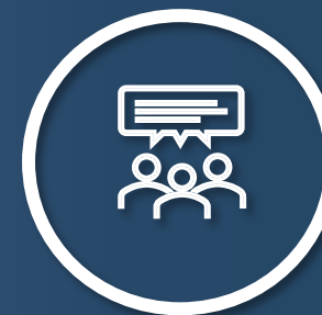
Construction & Designers Coordination