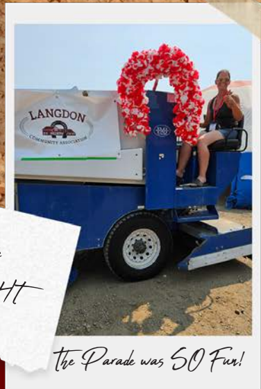
The Parade was SO Fun!