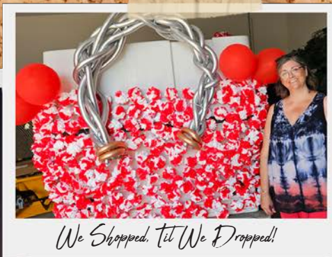
We Shopped, til We Dropped!