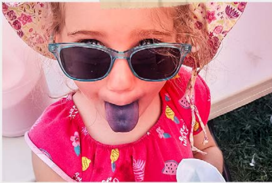
I really loved my free sno-cone!

The Langdon Days Parade is quickly becoming one of the most celebrated traditions of Langdon Days.