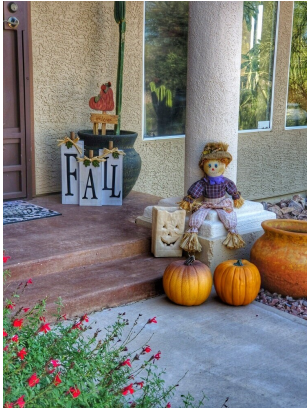
A bountiful Fall welcome on Silver Eagle Court!

I'm looking forward to seeing Sunridge neighbors "deck the halls" in the holiday spirit these next few weeks. It's a wonderful time of year and if the past years are any indication, I know Sunridgers will celebrate the holidays in style! The Board looks forward to showcasing decorated homes on our website and in the next newsletter , so get those lights plugged in, wreaths posted, and mistletoe hung (and send me your best pics!)