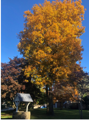
Autumn leaves in New York