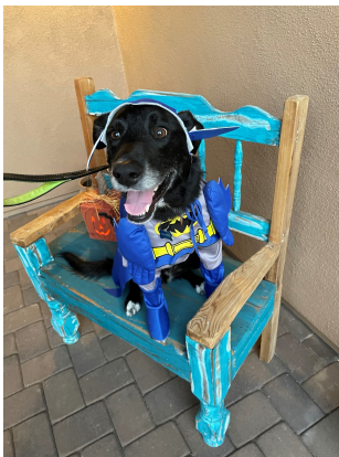
The way our pets humor us... Austin is such a good dog!

I'm looking forward to seeing Sunridge neighbors "deck the halls" in the holiday spirit these next few weeks. It's a wonderful time of year and if the past years are any indication, I know Sunridgers will celebrate the holidays in style! The Board looks forward to showcasing decorated homes on our website and in the next newsletter , so get those lights plugged in, wreaths posted, and mistletoe hung (and send me your best pics!)