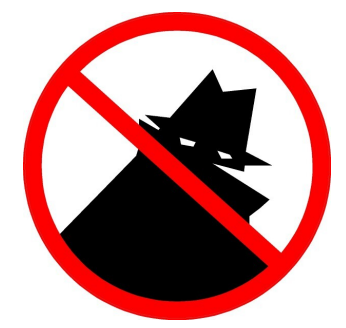
Urgent! Sunridge needs volunteers for the Neighborhood Watch program.