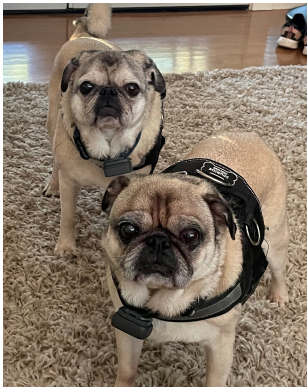
Gabe and Gretzky, my lovable pugs!

We're looking for volunteers from to help the Board set up a "service" of sorts to help some of our residents who may need assistance from time to time. In the past few months, Board members recently met several neighbors who are homebound, have recently lost a family member, or who would just like to receive visitors. Whether it's assisting with errands, providing help, and/or just checking in occasionally, we're looking for volunteers who are willing to lend a hand, an ear, or just some time to keep Sunridge a community that truly cares about our neighbors. If you'd like to help out, please drop me an email and let me know. Thank you: it's this type of community spirit and genuine caring that makes Sunridge a truly special place to call home!