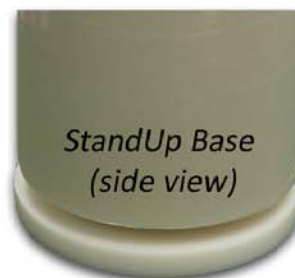
StandUp Base (side view)