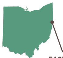
EAST LIVERPOOL, OH