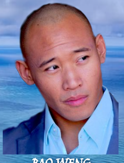
BAO WENG "The Boxer"

An exiled Chinese Admiral from Hong Kong. Xhang is fluent in English but refuses to speak it. He is only in Hawai'i on business to buy weapons. These include the US-made Gatling guns smuggled in by Orion and Tomi.