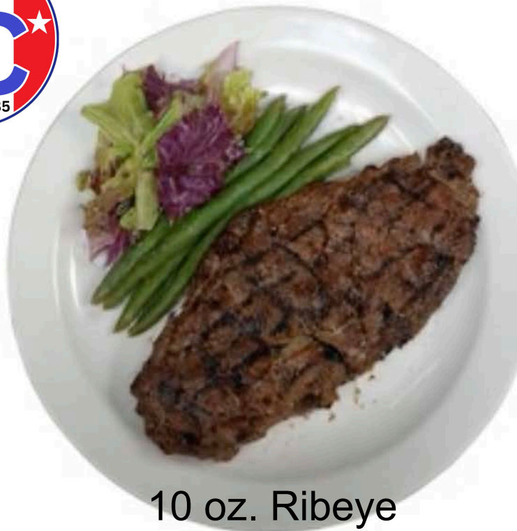
10 oz. Ribeye