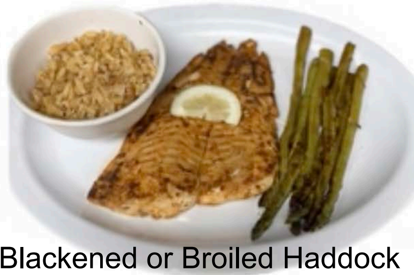
Blackened or Broiled Haddock