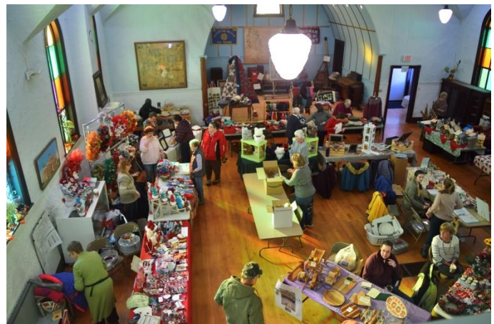
Holiday Craft Sale from 2019. There were no events in 2020.

Saturday, November 13 from 9AM to 2PM: The Annual Holiday Craft and Bake Sale with Crock Pot Café at BHS is back! Gifts, food and the drawing for the winner of the barn quilt!