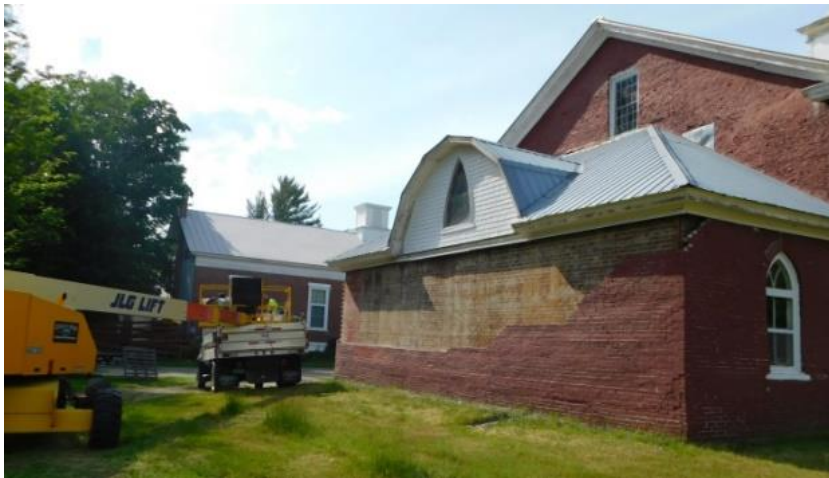
Start of work-removing the bricks

As the frost came out of the ground in the spring of 2020, we began to see accelerated damage to the addition to our building—larger cracks in the mortar on the south wall of the addition along with the slippage of bricks on the south east corner. Inside we noticed that there had been an increased movement of the stage steps, more ripples in the embossed metal on