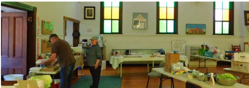
Take-out spaghetti dinner fundraiser from May 29, 2021.

This fundraiser was very successful for us, especially given the constraints imposed by the COVID pandemic, and it worked out well for our friends and neighbors in town. People were happy to get some wonderful comfort food and happy to get in the car and have an easy to drive to get it.