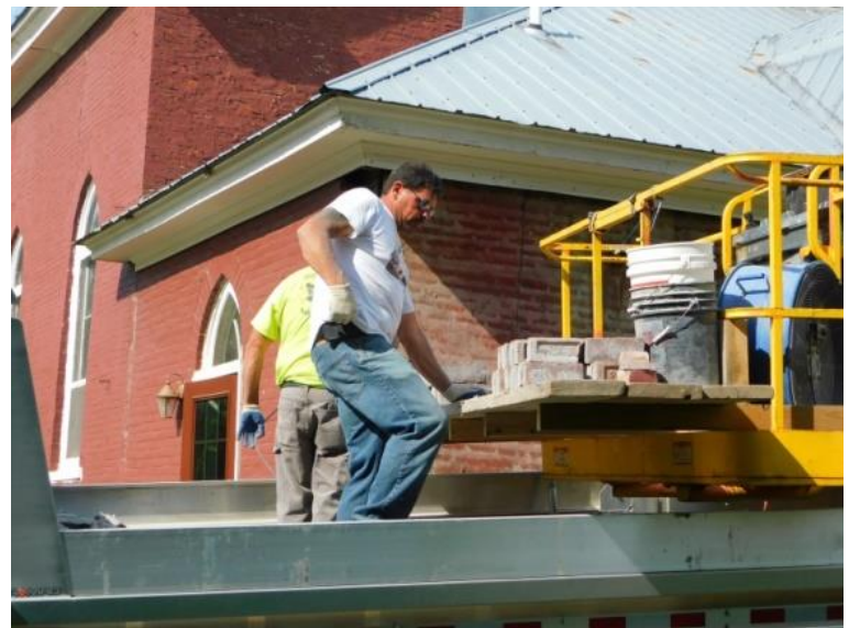
The bricks were removed. The reusable ones were cleaned of mortar, washed and stacked on pallets.

This was damage that our Building Committee knew had to be addressed without any further delay.