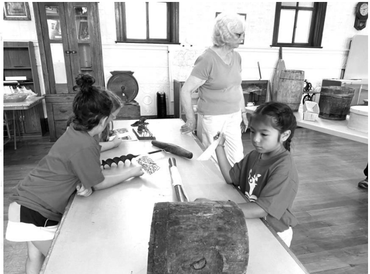
Campers examining some of the unfamiliar and interesting objects in our collection