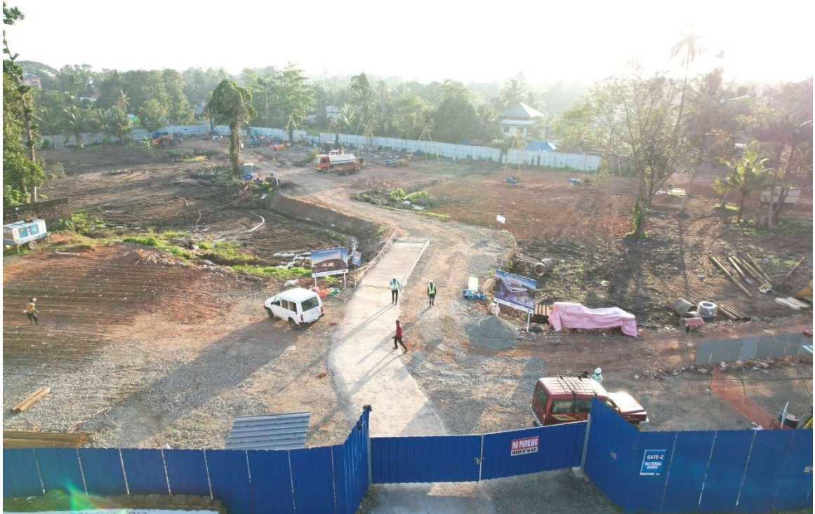
Plate No. 1