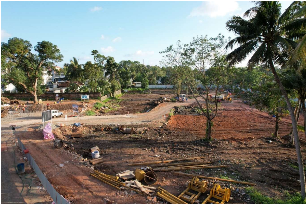
Photograph of the project site