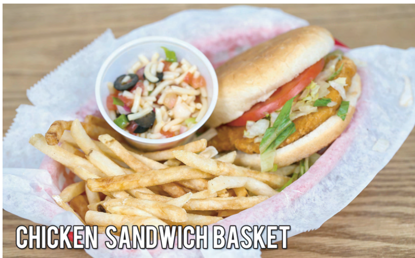
CHICKEN SANDWICH BASKET