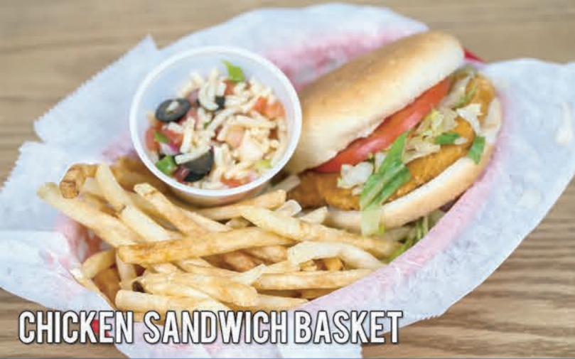
CHICKEN SANDWICH BASKET