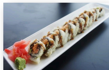
Spicy Kani Crunch