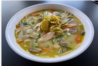
Sesame Chicken Soup