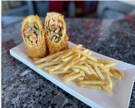
Curry Salmon Cornflake Wrap

Devon Wrap Fried Tilapia, Crispy Onion, Mixed Cabbage, Tomato, Cucumber, Roasted Garlic Mayo 18.95 ◆ ■ ●