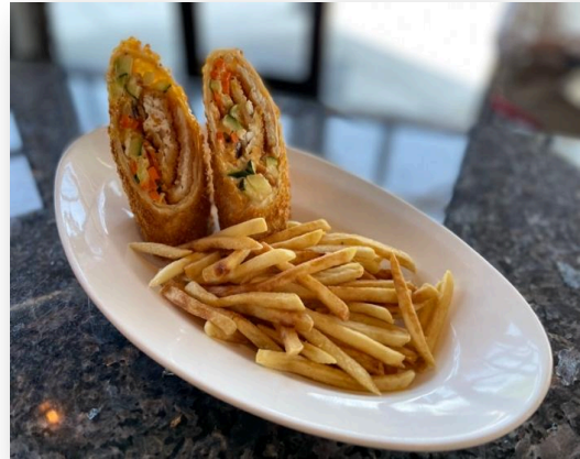
Szechuan King Cornflake Wrap