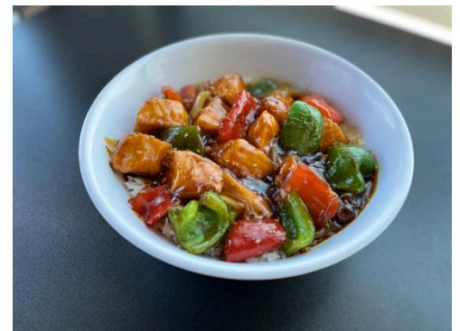
Salmon Teriyaki Poke

Consuming raw or undercooked meats, poultry, seafood, or eggs may increase your risk for foodborne illness. Please inform your server if you have an allergy before placing your order.