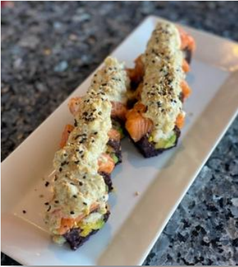
Barcelona Jalapeño Roll