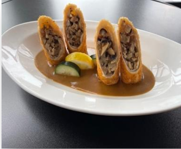
Tori Karu Maki

Tori Haru Maki Panko-Breaded Eggrolls Filled with Roasted Diced Chicken, Shiitake Mushroom and White Onion, Served with Tamarind Pineapple Sauce [2 pcs.] 15.95 ◆ ■ ●