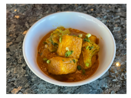
Curry Tofu and Broccoli Sautéed Broccoli, Onion and Deep Fried Tofu in Homemade Curry Sauce, Sprinkled with Green Onion. Served with White Rice 18.95

Curry Veggie Delight Sautéed Onion, Garlic, Broccoli, Potato, Chickpea and Zucchini in Homemade Curry Sauce. Served with White Rice 18.95