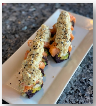
Barcelona Jalapeño Roll