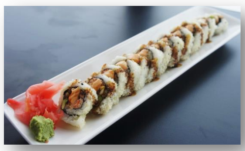
Spicy Kani Crunch