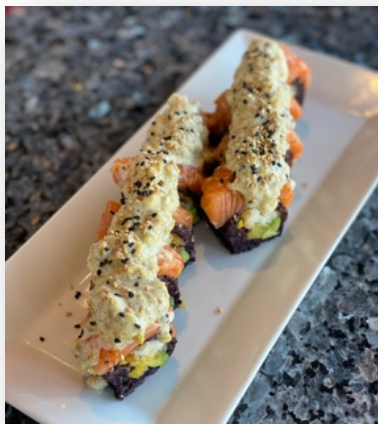
Barcelona Jalapeño Roll