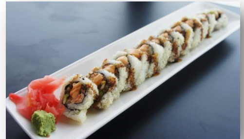
Spicy Kani Crunch