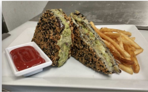
Sesame Eggplant Sandwich