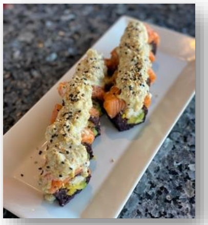
Barcelona Jalapeño Roll