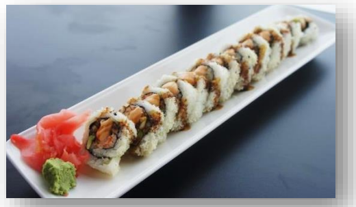
Spicy Kani Crunch