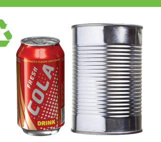
CANS Aluminum & Steel