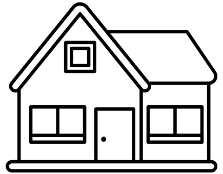
Next Door Right