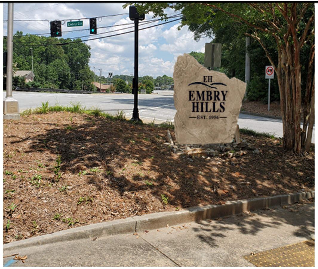
Boulder Size - 36" wide by 52" tall by 8" thick

* NOTE THAT NO TWO BOULDERS ARE THE SAME. *ALL FONTS AND IMAGES MAY VARY SLIGHTLY ON COMPLETED PRODUCT. PROOFS SHOWN ARE NOT EXACT REPRESENTATIONS AND LIKE ALL NATURAL MATERIALS VARIATION IS NORMAL.