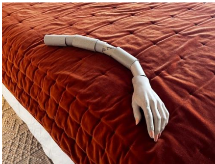
Untitled (spare hand) 2024, Cecilia Bonilla, toilet rolls, mannequin hand, approx 60 x 20cm