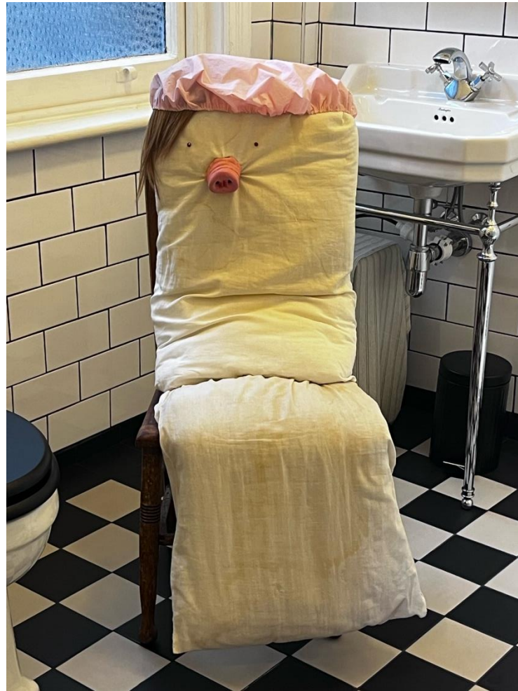
Pig in Bathroom , 2026, Jemima Brown, wicker/wooden chair, fabric, glass, rubber, plastic and hair, 100 x 50 x 55cm