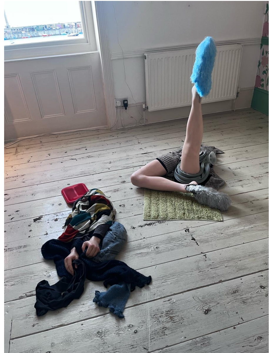
Layers , 2026, Jemima Brown, clothing, bathmat, fiberglass, rubber, jesmonite, acrylic, plastic, 105 x 170 x 170cm