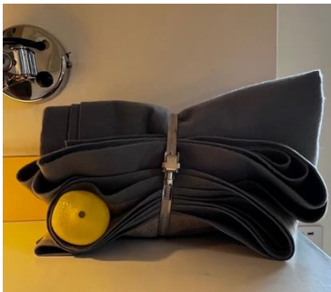
Clamp Clip , 2025, Chiara Williams, folded felt, ducting clamp, plastic lemon, steel nail, 16.5x15.5cm