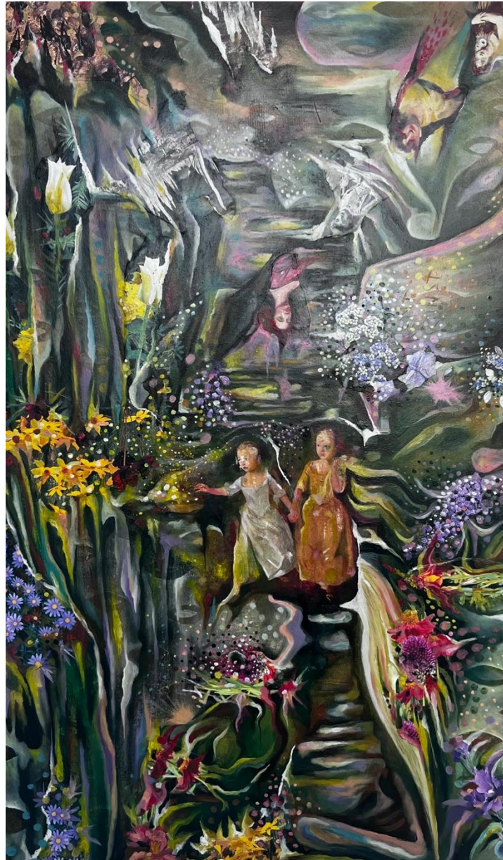
Intermediaries , 2025, Lupen Crook, Oil and Mixed Media on board, 24 x 16"