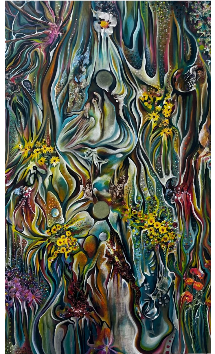
Quiet Psyche , 2025, Lupen Crook, Oil and mixed media on canvas 122 x 90cm