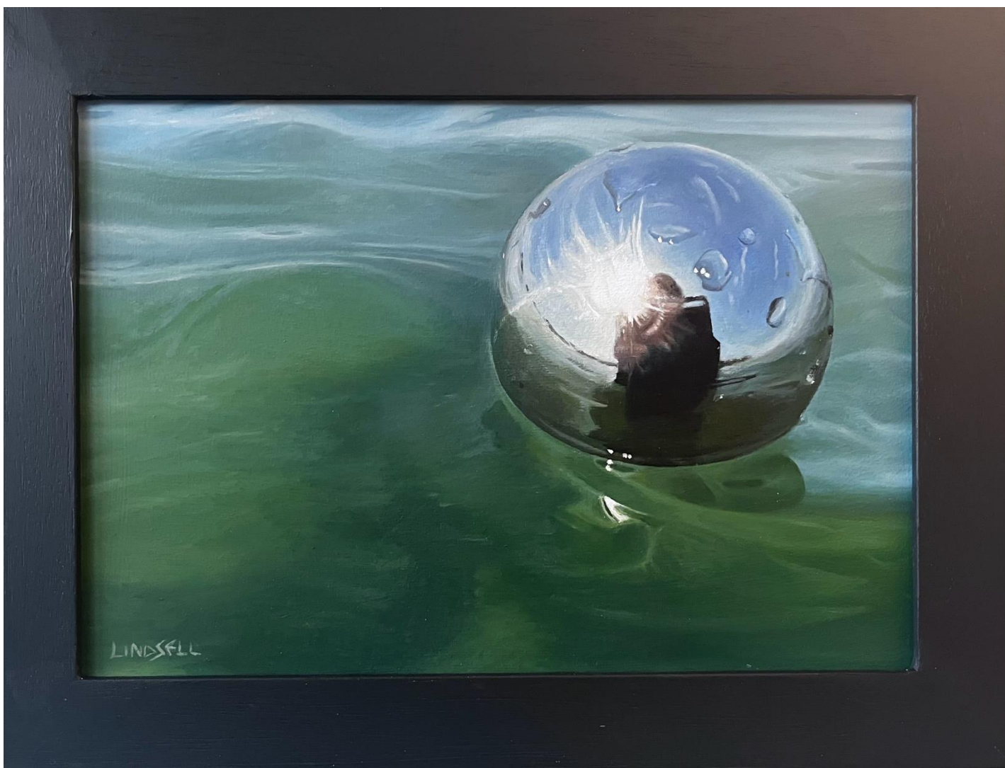
Untitled , 2026, Lucy Lindsell, Oil on canvas with handmade frame