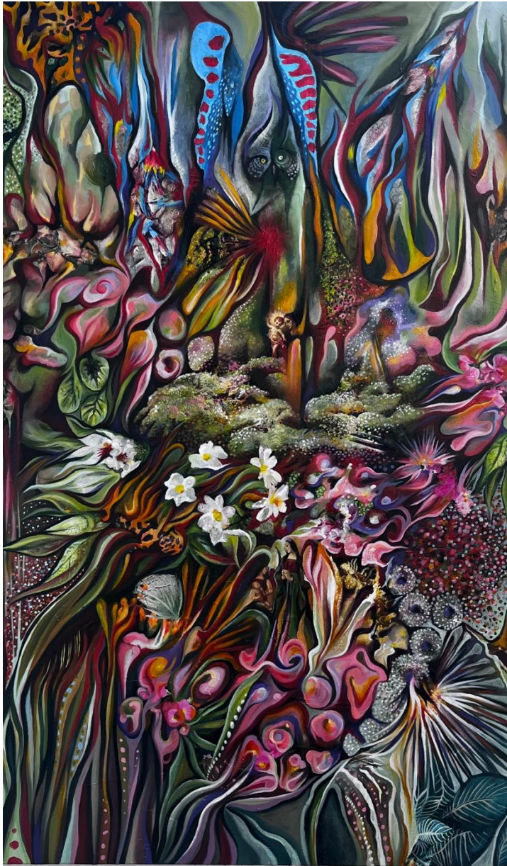
Faith In Nature , 2025, Lupen Crook, Oil on canvas, 122 x 90cm