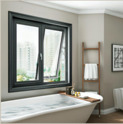
Flat Window with Wrapped Edge