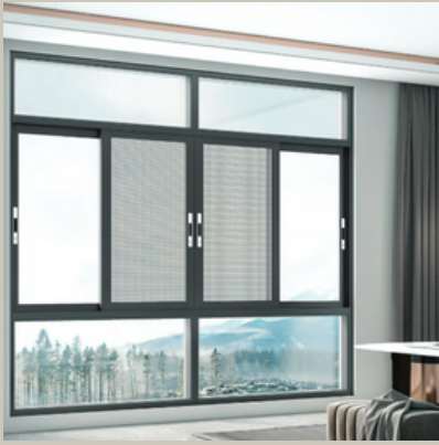
Non Broken Bridge Sliding Window