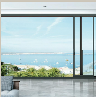
Pan Side Pressure System Window