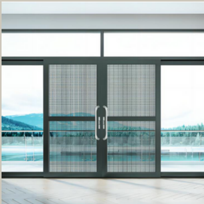
Heavy Duty Sliding Door