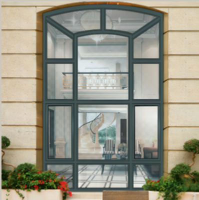
Broken Bridge Casement Window