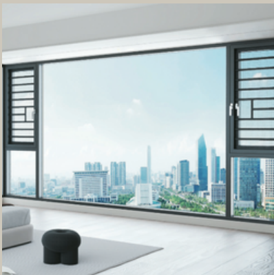
Broken Bridge Window Screen Integrated