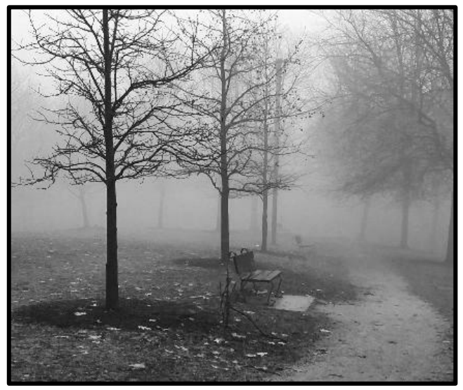
followed the snow.

We have turned the clocks back and are suddenly immersed in afternoon darkness, following an early sunset of