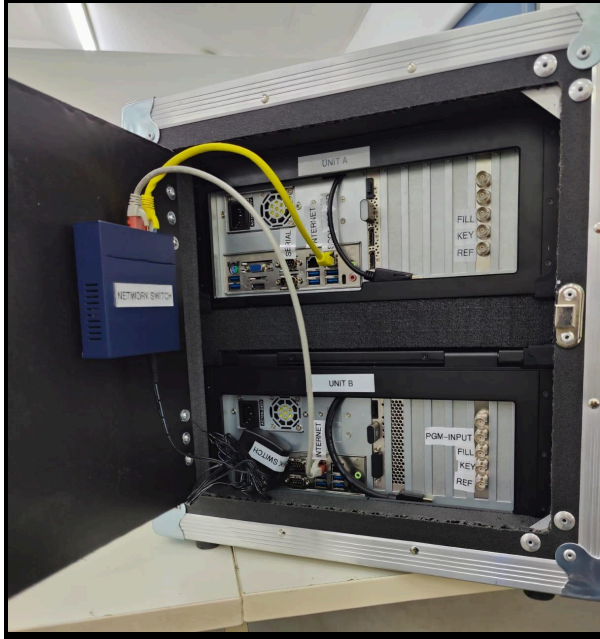
Connect Unit B Lower unit