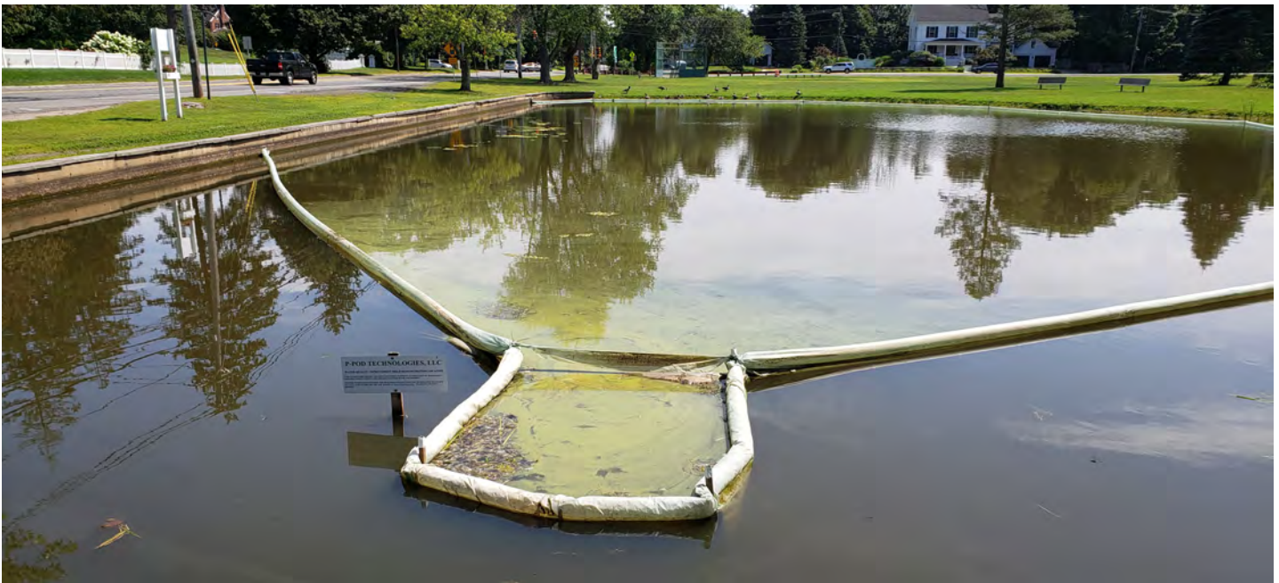
Photograph: August 18, 2019, Proof of Concept A-Pod prototype with captured cyanoHABs, Upper Green Pond, Newbury, Massachusetts. A detachable A-Pod collection member can be seen in the background awaiting use in active mode as needed. The A-Pod is also keeping areas “behind and in the foreground” of the A-Pod relatively free of cyanoHABs from the remainder of the pond. This is part of the preventative or sentry use capability of the A-Pod to control and limit harm posed by new cyanoHAB events to non-impacted areas of a water body.

Year 2019 was a fairly typical year with normal amounts of precipitation and temperature changes. CyanoHAB bloom season started in late May with the frequent lifting of benthic cyanoHAB mats from the bottom. Water clarity from May to August was varied between 2.5 to 3.5 feet depending primarily upon cyanoHAB conditions. Lifting of benthic cyanoHAB mats often occurred on sunny days as the cyanoHABs