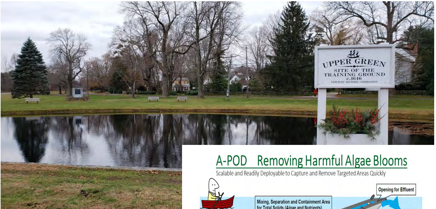
November 2019 Upper Green Pond, Newbury, Massachusetts