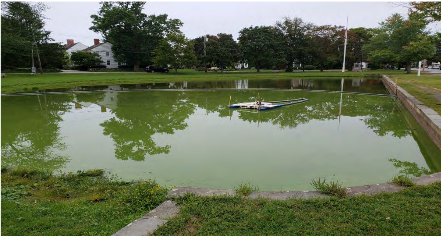
Photograph: September 13, 2018, Proof of Concept A-Pod prototype with cyanoHAB bloom, Upper Green Pond, Newbury, Massachusetts.

Year 2018 was characterized by heavy and frequent rain events from mid-July until January 2019. There were very few Canada geese at the pond in 2018. Unusual for the New England region, it was not until September and October 2018 that sustained cyanoHAB blooms occurred as noted in the following photograph. An earlier bloom occurred just prior to heavy rains in July but the heavy rains appeared to have knocked-down the active bloom.