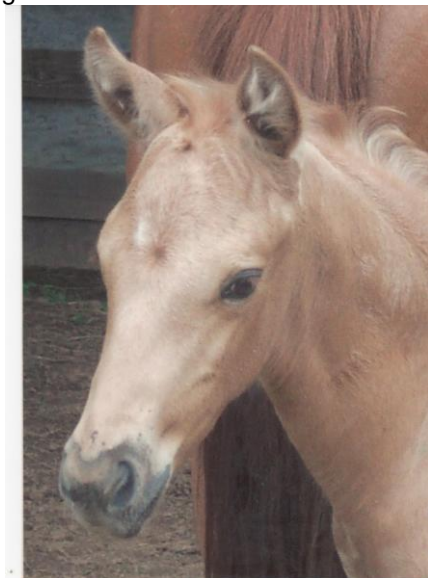
Liberty as a foal