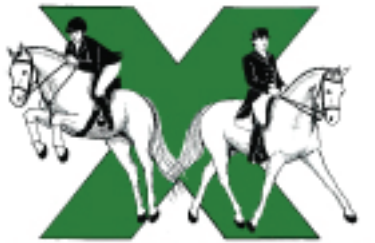
Region 3 USDF GMO #0319

CDCTS is a USDF Group Member Organization that caters to dressage and combined training (eventing) riders and enthusiasts in the Knoxville area and throughout East Tennessee.