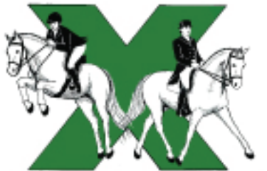
Region 3 USDF GMO #0319

CDCTS is a USDF Group Member Organization that caters to dressage and combined training (eventing) riders and enthusiasts in the Knoxville area and throughout East Tennessee.