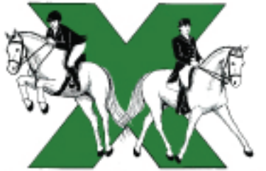
Region 3 USDF GMO #0319

CDCTS is a USDF Group Member Organization that caters to dressage and combined training (eventing) riders and enthusiasts in the Knoxville area and throughout East Tennessee.