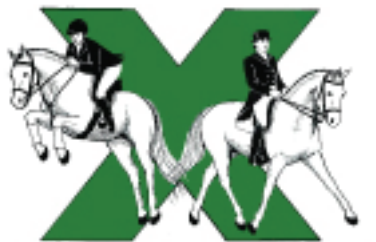
Region 3 USDF GMO #0319

CDCTS is a USDF Group Member Organization that caters to dressage and combined training (eventing) riders and enthusiasts in the Knoxville area and throughout East Tennessee.