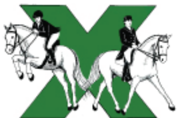
Region 3 USDF GMO #0319

CDCTS is a USDF Group Member Organization that caters to dressage and combined training (eventing) riders and enthusiasts in the Knoxville area and throughout East Tennessee.