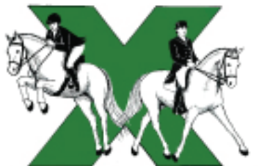
Region 3 USDF GMO #0319

CDCTS is a USDF Group Member Organization that caters to dressage and combined training (eventing) riders and enthusiasts in the Knoxville area and throughout East Tennessee.