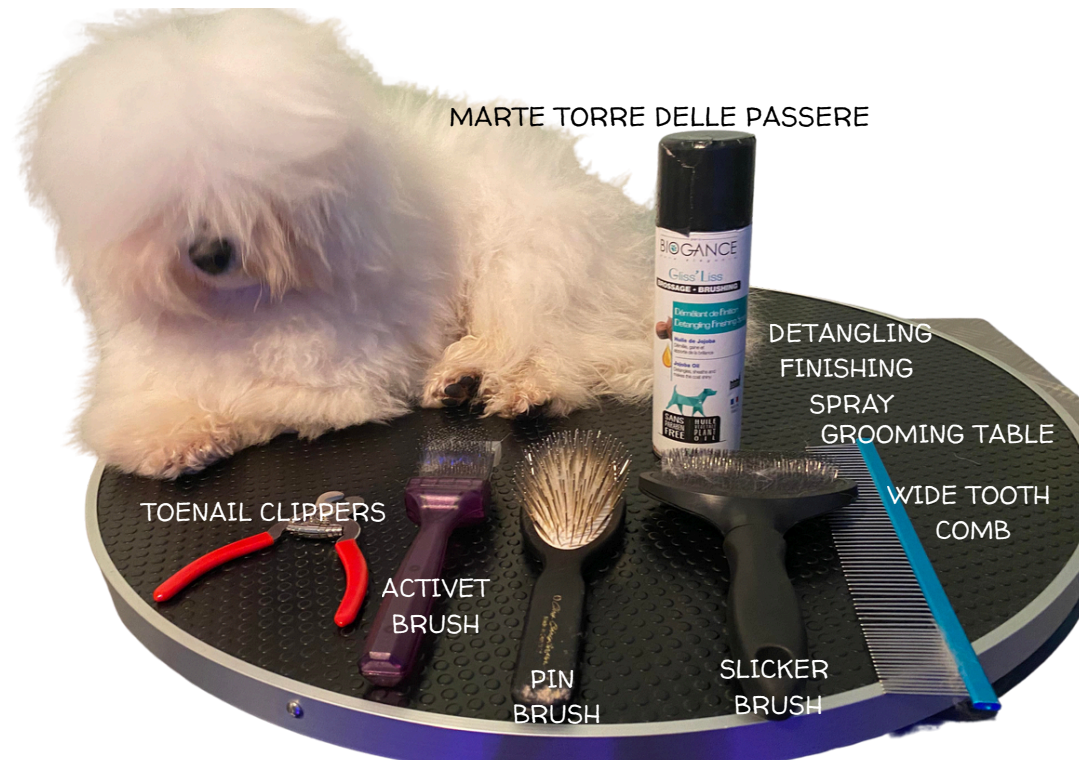
MARTE TORRE DELLE PASSERE

While air-drying produces the desirable exhibition "curls," it also increases the likelihood of knotting. Therefore, Jessie recommends brushing and blow-drying the coat to maintain manageability between shows.