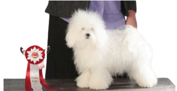
JACKIE "KRISTA" LITTLE WHITE WONDER KENNEL

Jessie Manders, a breeder and exhibitor from Little White Wonder in the Netherlands, utilizes the grooming tools displayed in the photo below.