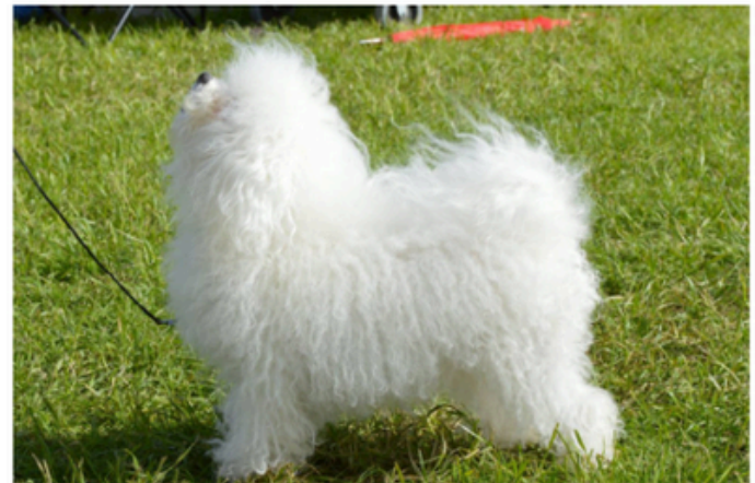
COCCHETTI, F. (2020, APRIL 30). BOLOGNESE: SESSIONE DIDATTICA ENCI (POWERPOINT PRESENTATION). ENTE NAZIONALE DELLA CINOFILIA ITALIANA (ENCI).